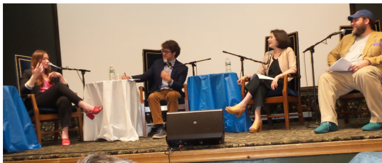
Guest - Clare Malone - FiveThirtyEight Writer and podcaster with Unorthodox Hosts